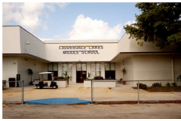
LAUDERDALE LAKES MIDDLE SCHOOL